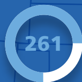
AFRICAN AMERICAN MALES